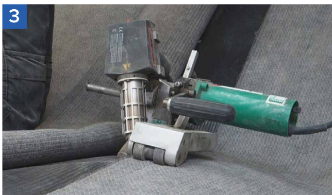
Thermal welding of CCX-B™ LLDPE backing