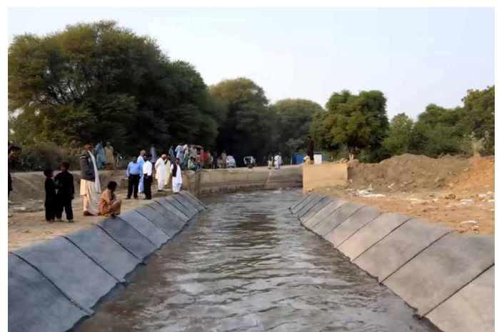
A CCX™ Bulk Water Infrastructure Remediation Installation