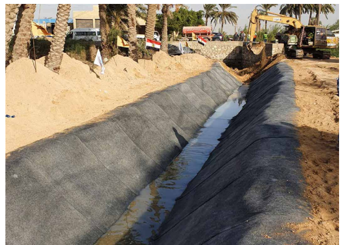
A CCX™ Irrigation Canal Installation