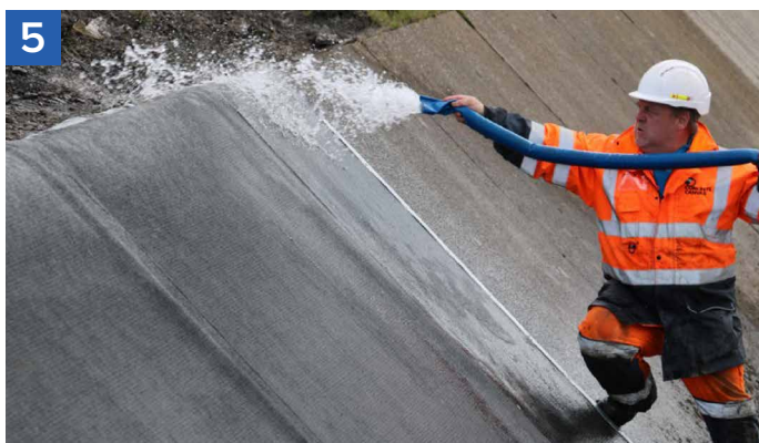
Hydration of CCX™