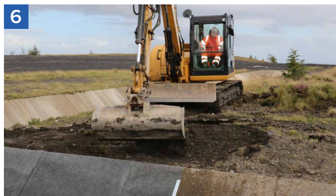
Backfilling anchor trenches to prevent ingress