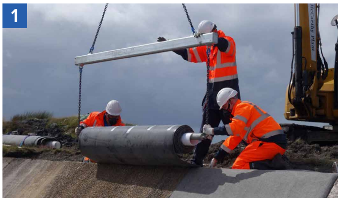
Deploying Bulk Roll of CCX™

As a result, CCX™ is the ideal solution for the lining and remediation of channels and irrigation canals, increasing their operational life and reducing water seepage losses.