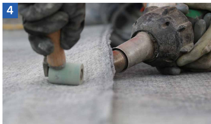
Thermally bonding overlapping layers of CCX™