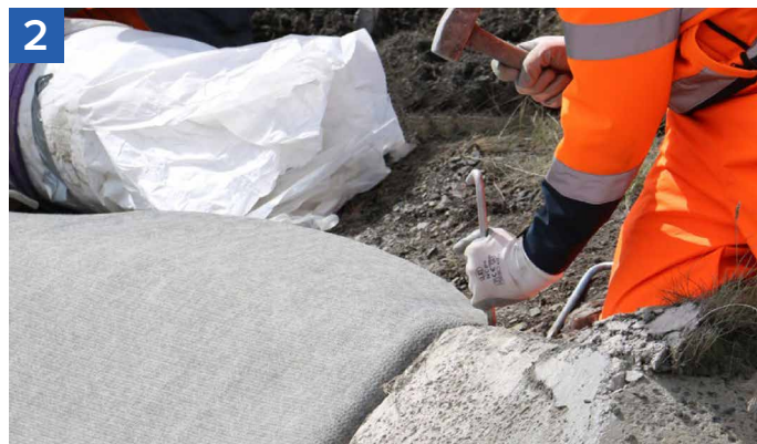
Pegging CCX™ within anchor trenches