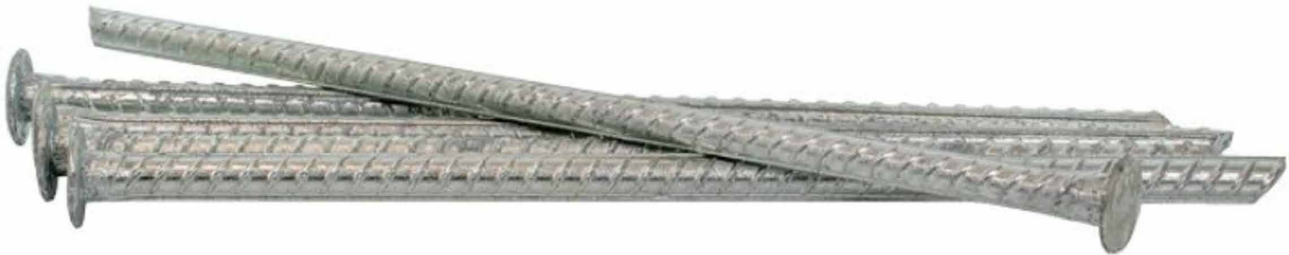
Figure 2 - TPIN360